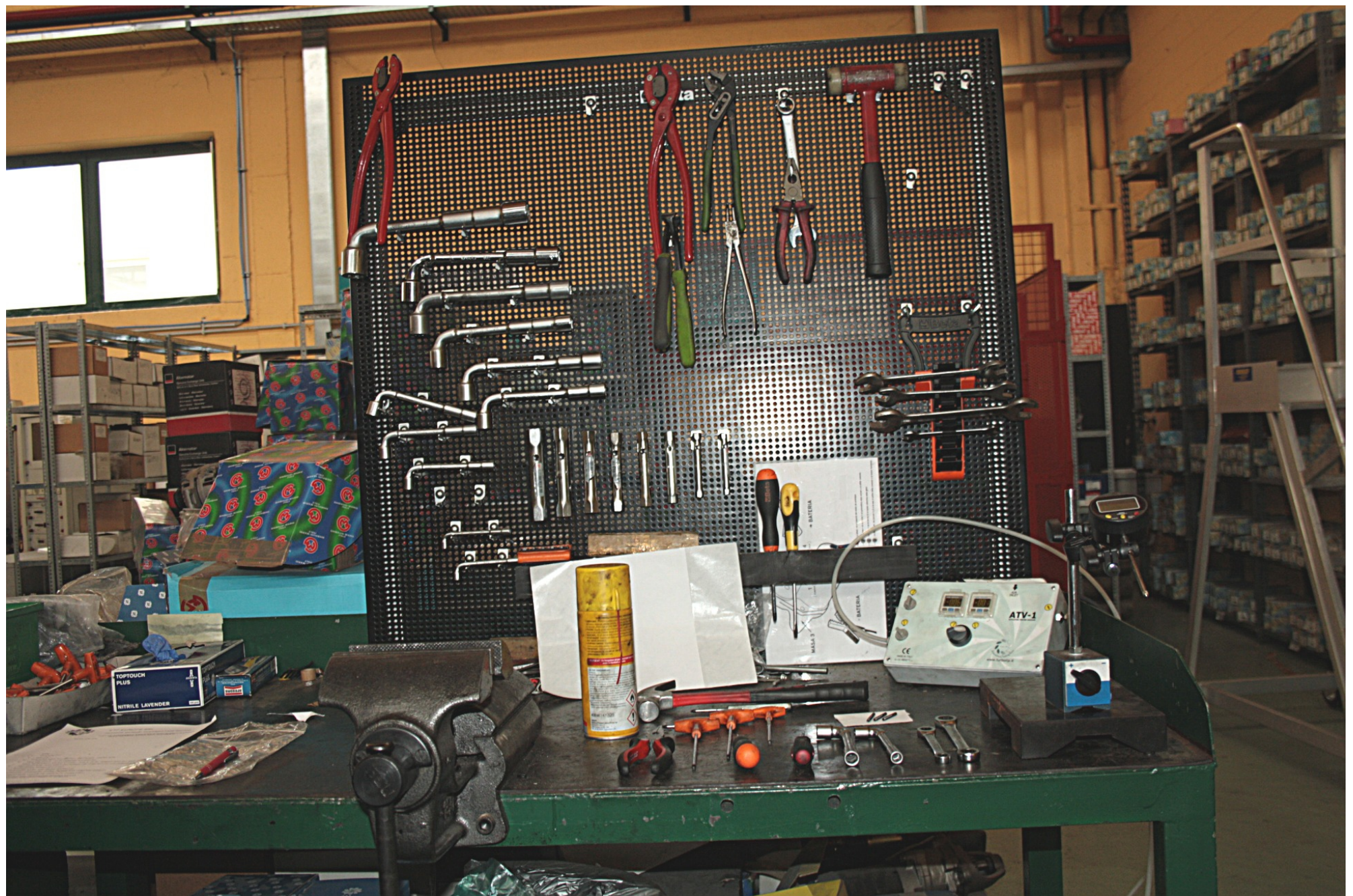
Bench equipped for turbo maintenance